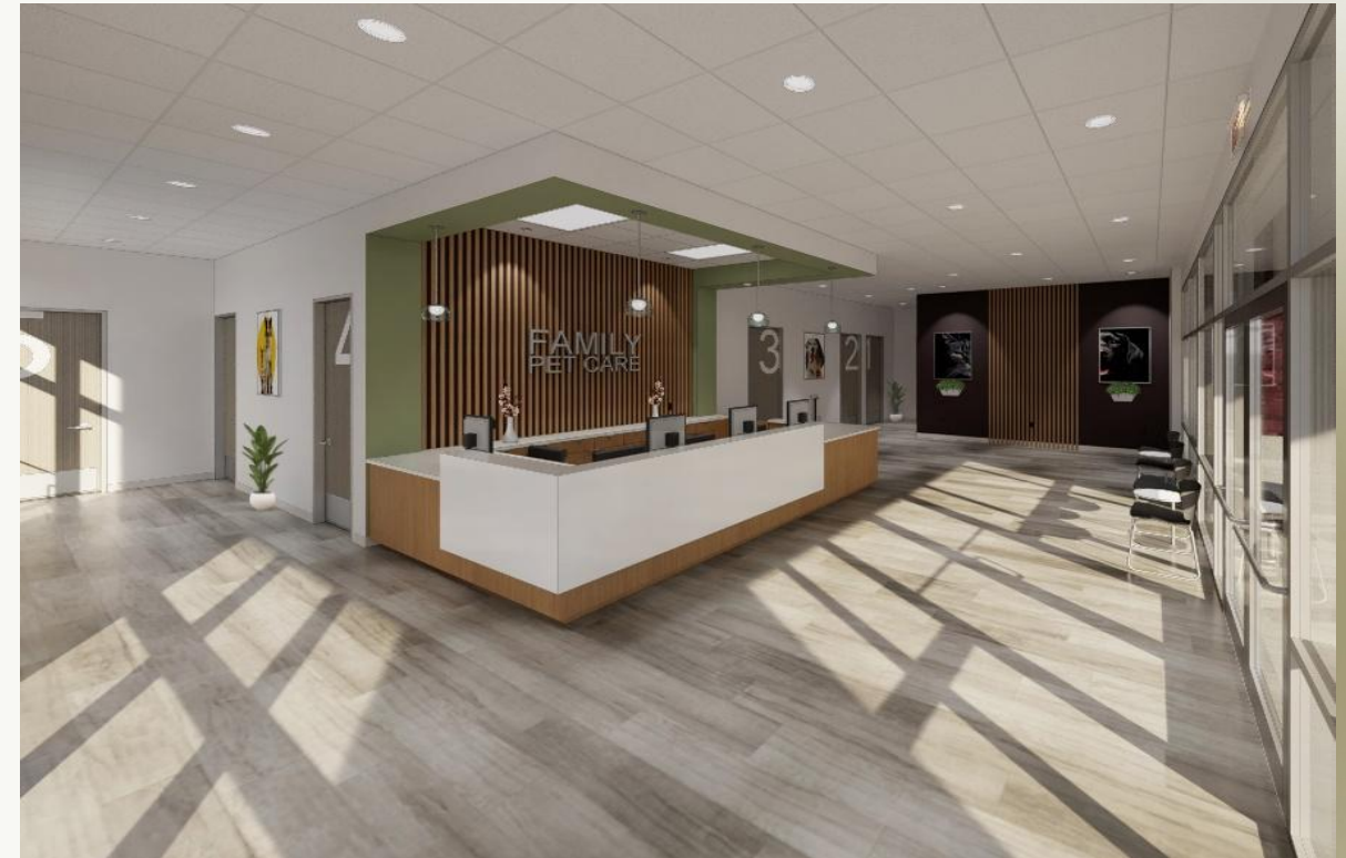
Newly completed Inspire hospital build-out in Houston, Texas